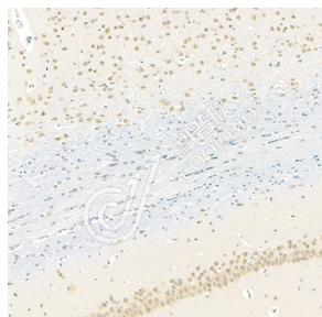
IHC 检测 Src 蛋白(货号 K135349). 样品: 大鼠脑, 4%多聚甲醛 (货号 KSG1101) 固定 12-24 小时. 抗原修复: 柠檬酸抗原修复液(干粉, pH 6.0) (KSG1201), 98°C, 20 分钟. 一抗: 1: 1500 稀释, 4°C 孵育过夜. 二抗: S-vision 免疫组化多聚二抗(山羊抗兔),即用型 (货号 KB3906), 室温孵育 20 分钟.