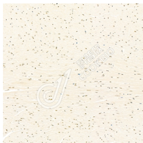
IHC 检测 CSHL1/CSL 蛋白(货号 K135883). 样品: 小鼠心, 4%多聚甲醛 (货号 KSG1101) 固定 12-24 小时. 抗原修复: 柠檬酸抗原修复液(干粉, pH 6.0) (KSG1201), 98°C, 20 分钟. 一抗: 1: 400 稀释, 4°C 孵育过夜. 二抗: S-vision 免疫组化多聚二抗(山羊抗兔),即用型 (货号 KB3906), 室温孵育 20 分钟.